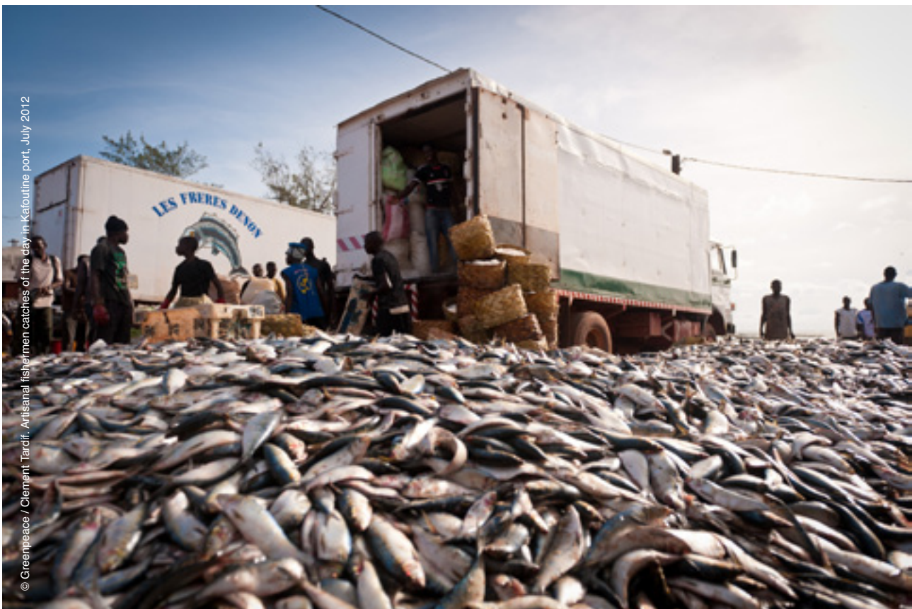
Artisanal fishermen catches of the day in Kaloutine port, July 2012

According to sources within the Ministry, very few fines were indeed recovered by the Senegalese government, apart from a few high profile cases amounting to a relatively small tens of millions CFA. In the meantime, partial information gathered by Greenpeace shows that total amount fined over the period amounted to well over a billion CFA ( see Annexe 1 ).